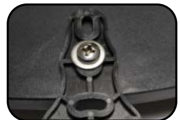
4. PROPER CLIP INSTALLATION