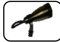
IGNITE LIGHT (x3)