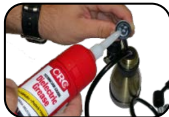
6. APPLY DIELECTRIC GREASE TO PLUGS