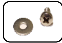
SCREW & WASHER (x3)