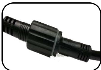
9. PROPERLY SEALED PLUG CONNECTIONS