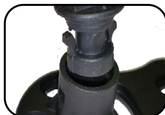
10. INSERT LIGHTS INTO CLIPS FASTENED TO FLOAT