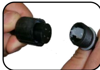
7. FIRMLY INSERT PLUGS TO AJOINGING IGNITE LIGHTS