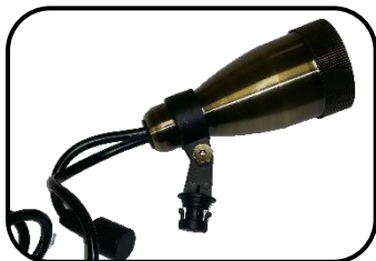
5. 3-WATT / 9-WATT IGNITE LIGHT (x3)