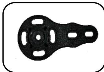
2. IGNITE LIGHT CLIP (x3)