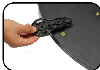
3. FASTEN CLIP TO FLOAT WITH SCREW & WASHER (x3)