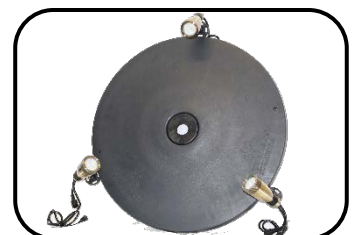
12. PROPERLY ASSEMBLED IGNITE LIGHT KIT INSTALLED