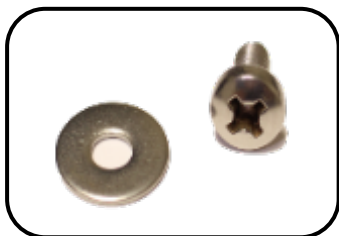
1. SCREW & WASHER (x3)