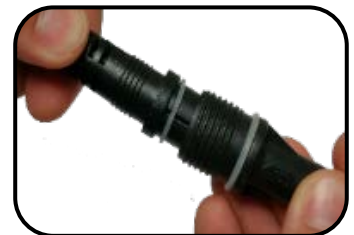
8. BE SURE O-RINGS ARE IN THEIR PROPER LOCATIONS