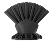
Fern - NEW!