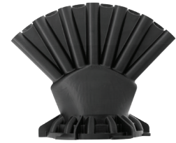
NEW Fern Nozzle

Further define your J Series experience with a Premium Nozzle, available for all HP sizes. New this year is the Fern Nozzle which provides an expansive, two-dimensional display for narrow ponds. Purchased separately, Kasco Premium Nozzles provide crisp and distinct streams of water for dramatic and captivating displays.